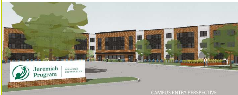
CAMPUS ENTRY PERSPECTIVE

ROCHESTER-SOUTHEAST MN 126 Woodlake Drive SE Rochester, MN 55904 507-215-8661