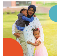
Safe & Affordable Housing