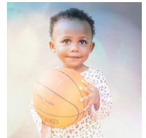
Quality Early Childhood Education